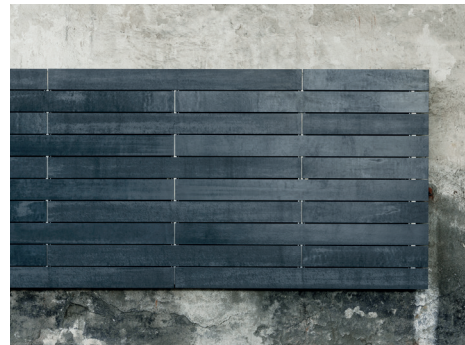
Coming soon! öko skin 147 mm, anthracite vintage, horizontal installation (1/2 shifted), glued on aluminum substructure