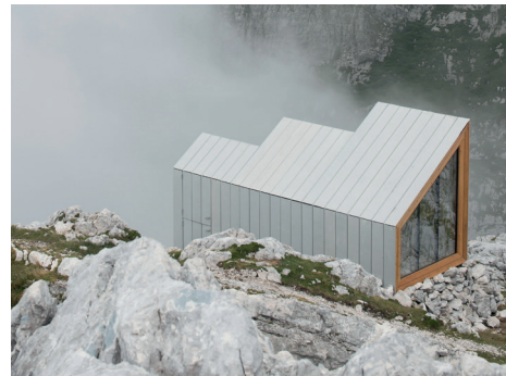
öko skin flex 147 mm, silvergrey, vertical installation, screwed on wooden substructure