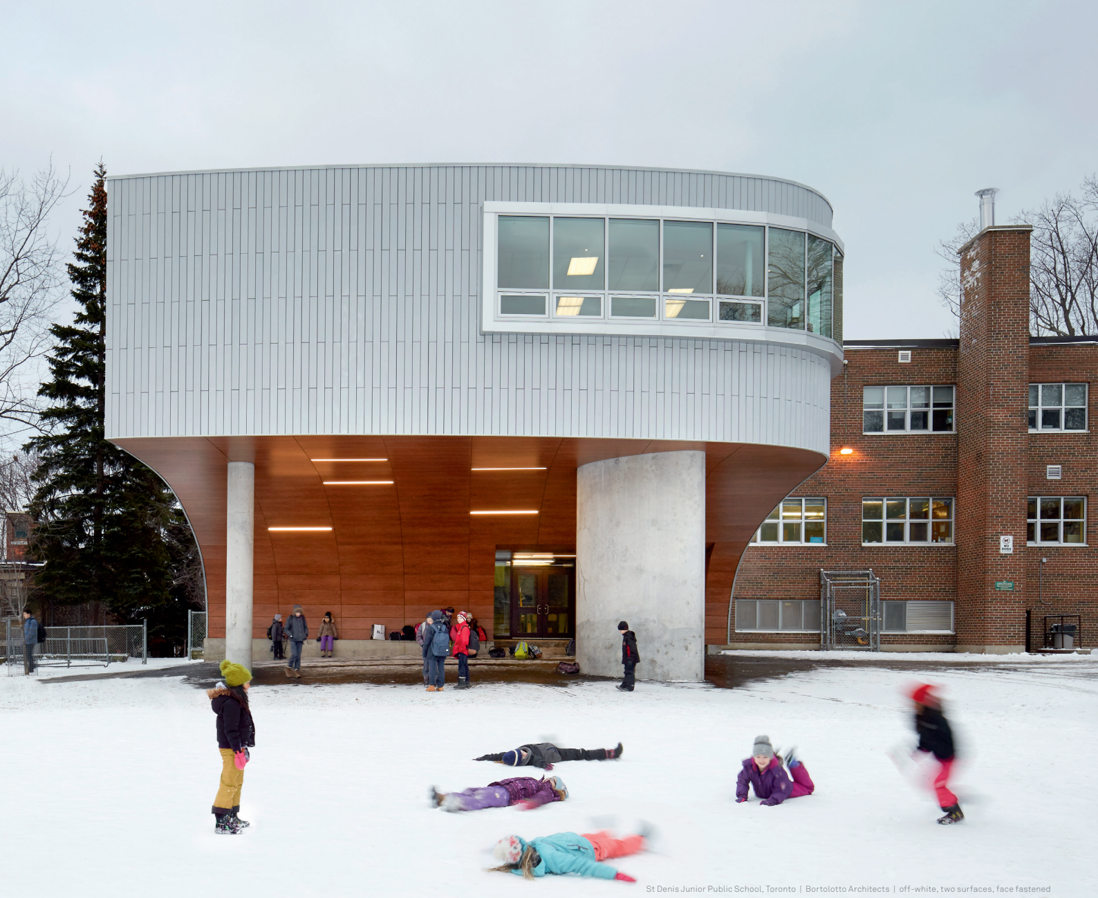
St Denis Junior Public School, Toronto | Bortolotto Architects | off-white, two surfaces, face fastened