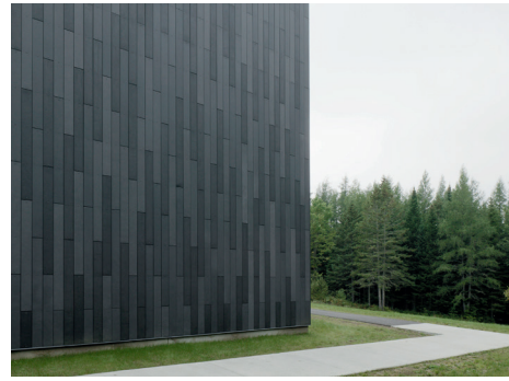
öko skin 147 mm, anthracite, vertical installation (1/3 shifted), screwed on aluminium substructure