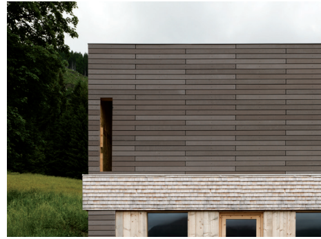
öko skin flex 125 mm, terra, horizontal installation (1/2 shifted), screwed on wooden substructure