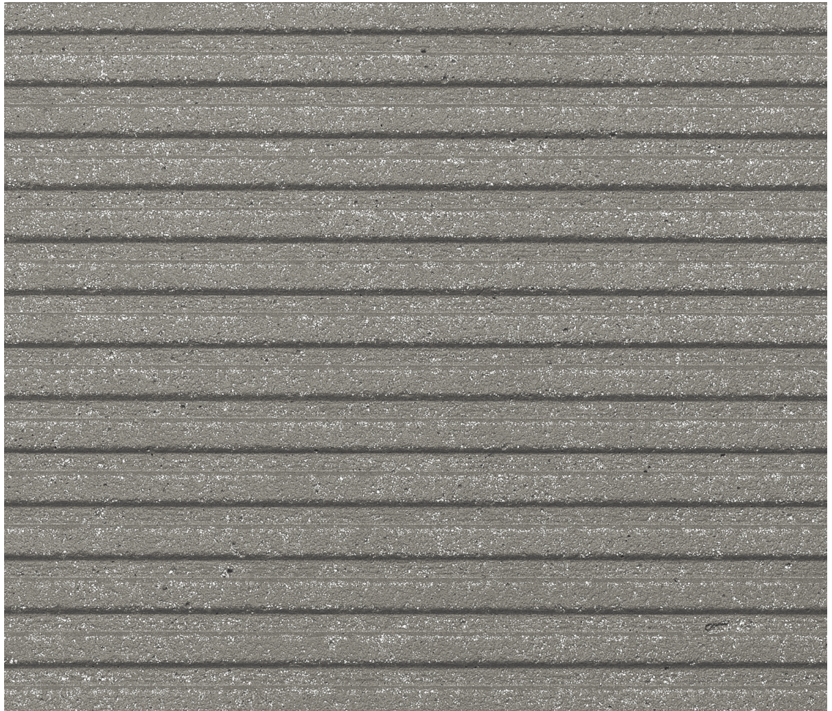
silvergrey | ferro light