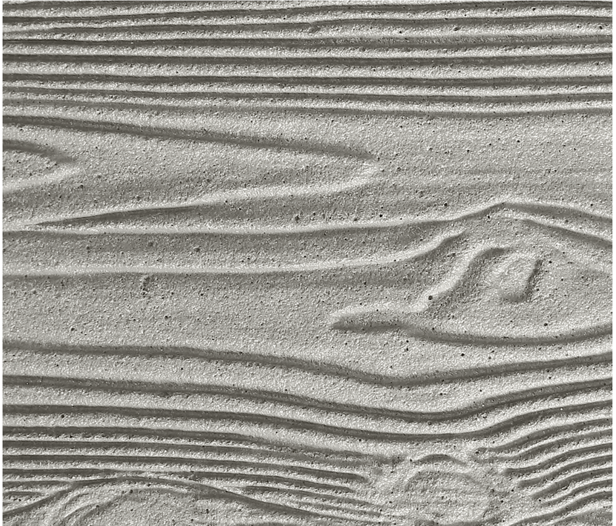
ivory | ferro

lumber is based on an authentic natural look. A homogeneous wood grain lends the building envelope a strong depth effect. Similar to wood, the facade panels have a multi-layered effect, but unlike wood, they do not require additional weather protection.