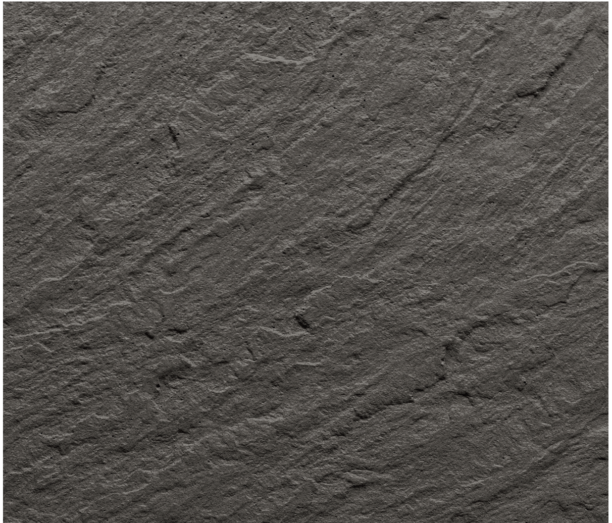
liquid black | ferro soft