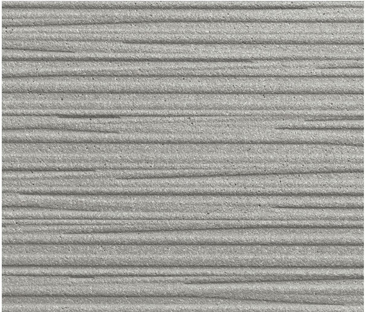
ivory | ferro light

Irregular lines playfully run across the slabs like ribbons. The combination of straight and angled, partially overlapping lines of different sizes creates an exciting visual effect on the facade. The flow of the lines harmoniously integrates into the overall picture.