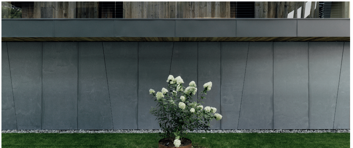
anthracite | matt